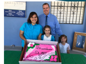
14 th Church Anniversary