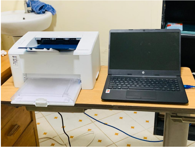
One of the new laptops and printer