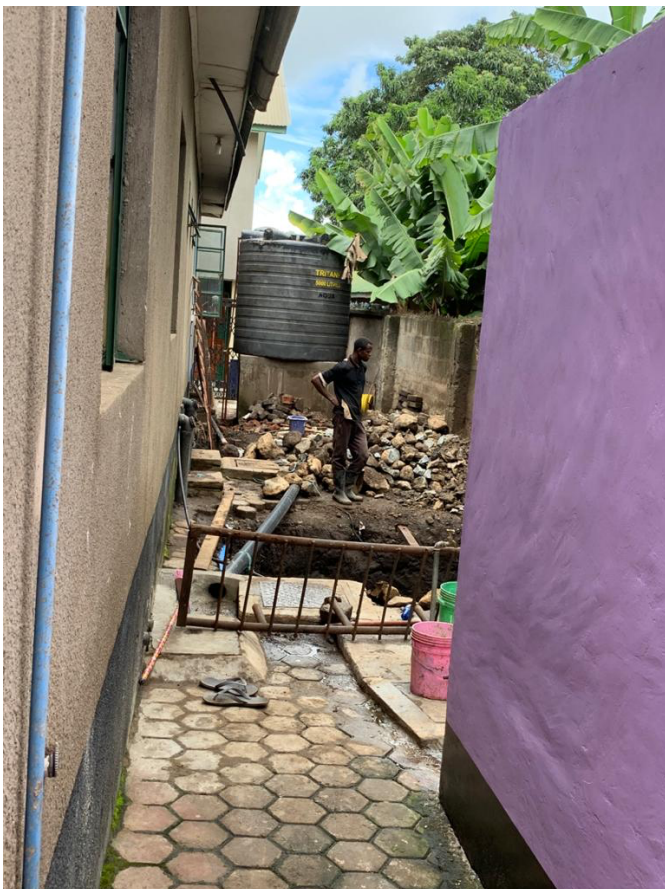
Getting a new sewer