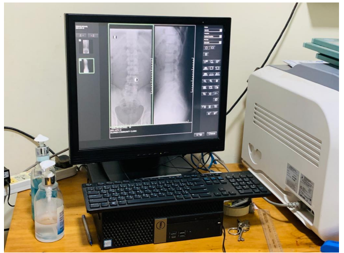
The new Desktop in the Exray room