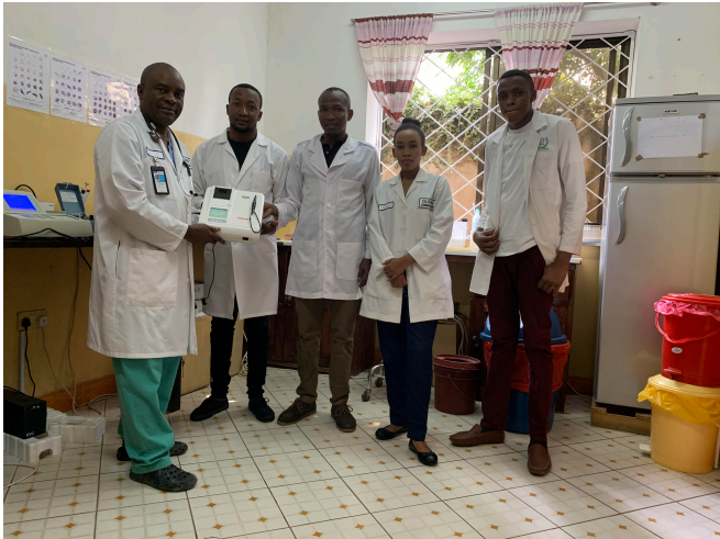
Our Lab staff and new machine 😊

robertbyemba@gmail.com / vsmithtanz@gmail.com